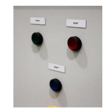
Only 3 buttons to operate