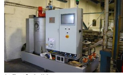
Intelligent Coating Unit