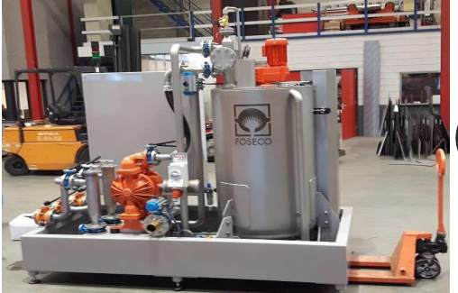
Advanced, fast and maintenance free inline density measurement system